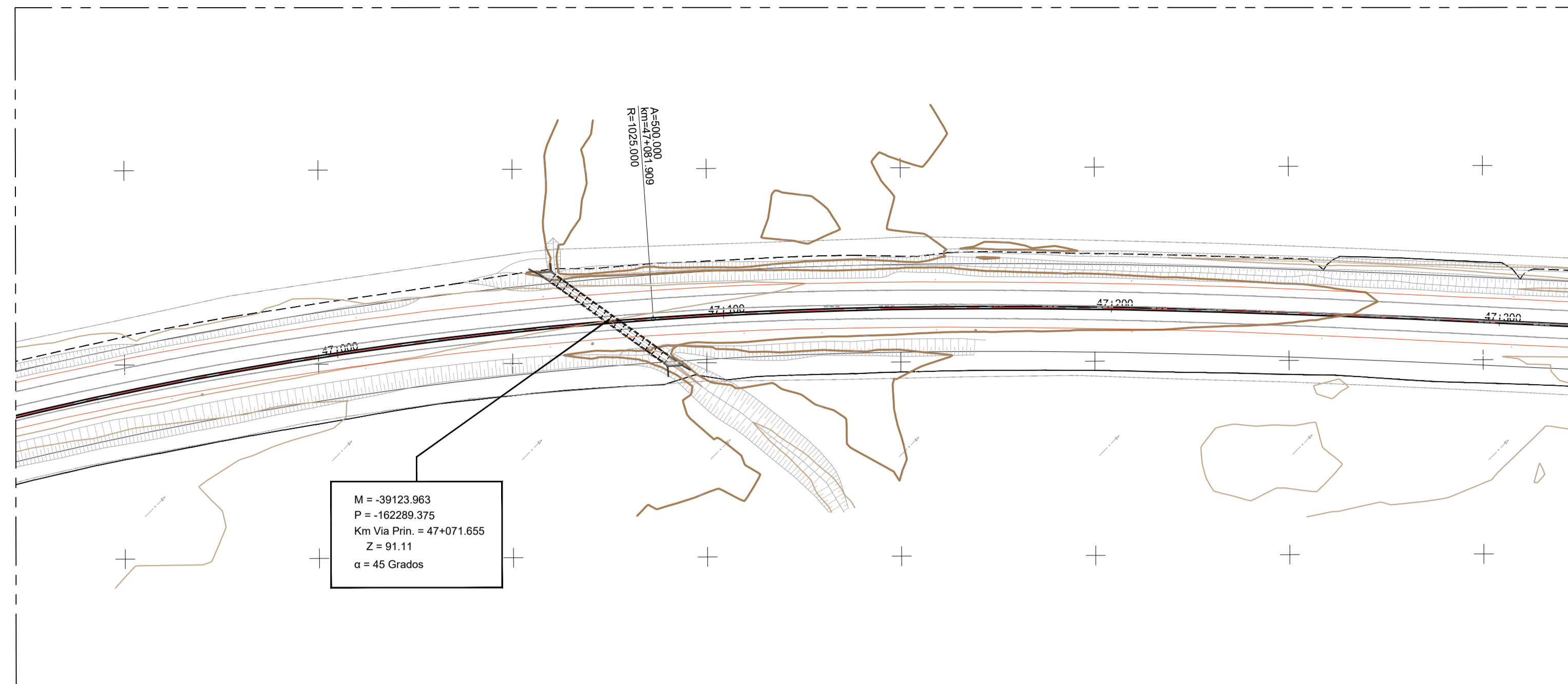
PLANTA DE IMPLANTAÇÃO ESC.=1:1000